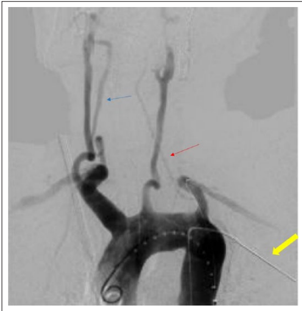
Figure 1. Pre-deployment aortogram (blue arrow: dominant right vertebral artery; red arrow: atretic left vertebral artery; yellow arrow: sheath).