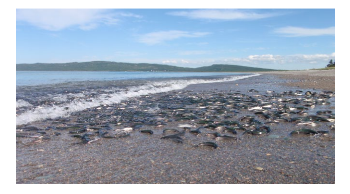
FIGURE 1 Capelin ( Mallotus villosus ) spawning on a Newfoundland beach. Beach spawning M. villosus gather close to the shore and then vigorously roll together in pairs or trios (two males and one female in the center) into the beach against the receding wave. Fertilization occurs in the few seconds between breaking waves and eggs immediately adhere to the sediment (see Templeman, 1948 for a detailed description).

took less than 30s for virtually all moving sperm to become non-motile (Figure S1); therefore, we chose to use 5s after sperm:water mixing to evaluate sperm behavior at different salinities (the earliest time that was possible to capture a high quality CASA video). Two subsamples of each animal's semen were recorded at each salinity for technical replication. These were averaged, and means of these subsamples are presented among individuals.