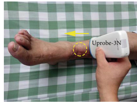
FIGURE 2: Ultrasound scanning of the right distal tibia using Uprobe-3N, a wireless ultrasound probe. The arrow indicates the scanning orientation. The dotted ellipse presents the site of LIPUS therapy.

After approximately three and half months, the kirschner wire in the right medial malleolus was removed and the surgical debridement of the right crus was performed under