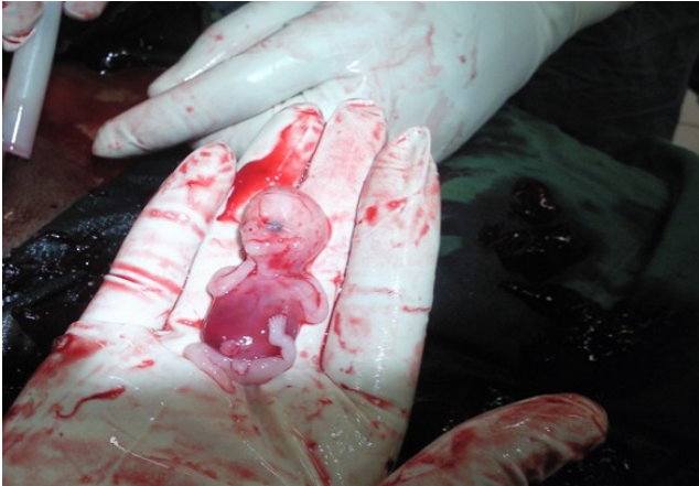
Figure 2: operative findings after emergency laparotomy showing the extra-uterine embryo