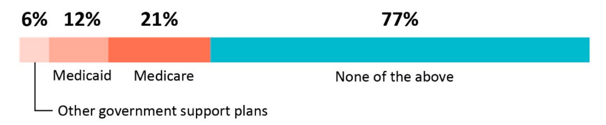
Figure 3. Participation in government supported health plans.

Clinicians report that providing care is more difficult because of professional stigma and their exposure to investigations and potential censure by state medical boards, insurers and hospital quality improvement committees. Three-quarters of respondents report having been stigmatized or treated disrespectfully by professional colleagues because they treat Lyme disease. The lack of professional support from colleagues (61%), opposition to treatment of PLD/CLD from some physician organizations (59%), limited ability to share office and practice burdens with other colleagues (20%), and being excluded from participating in insurance networks (11%) were cited as examples of professional marginalization.