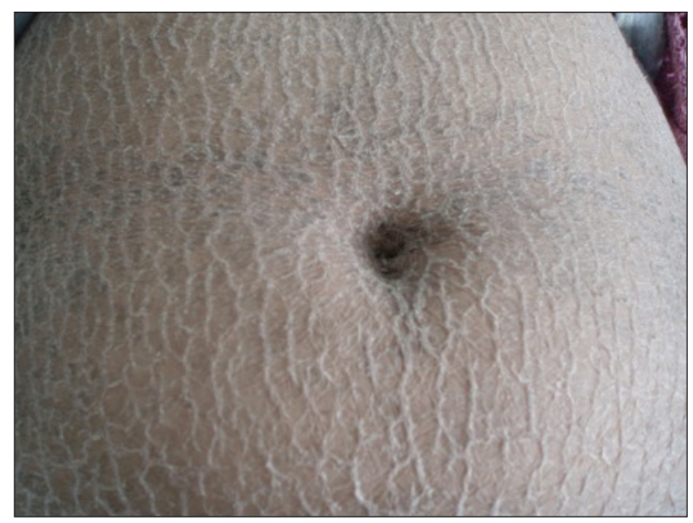
Figure 1. Ichtyosis of the belly skin.

The examination of the skin showed signs of generalized moderate erythema and fine scaling, involving the scalp, face, trunk and extremities (Figure 1). Our cases had thickened and hyperkeratotic palms