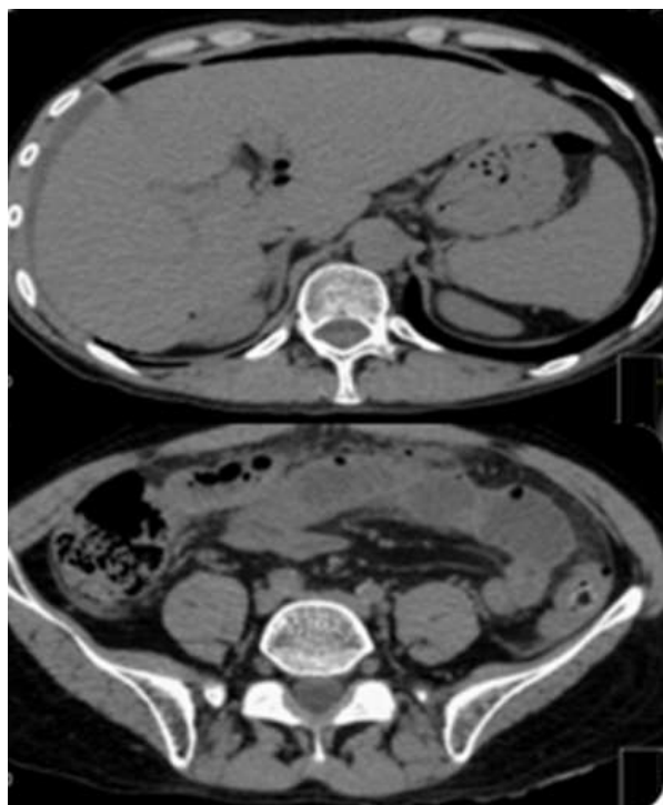
Figure 3 : CT scan showing intra-peritoneal fluid pneumoperitoneum and bowel perforation