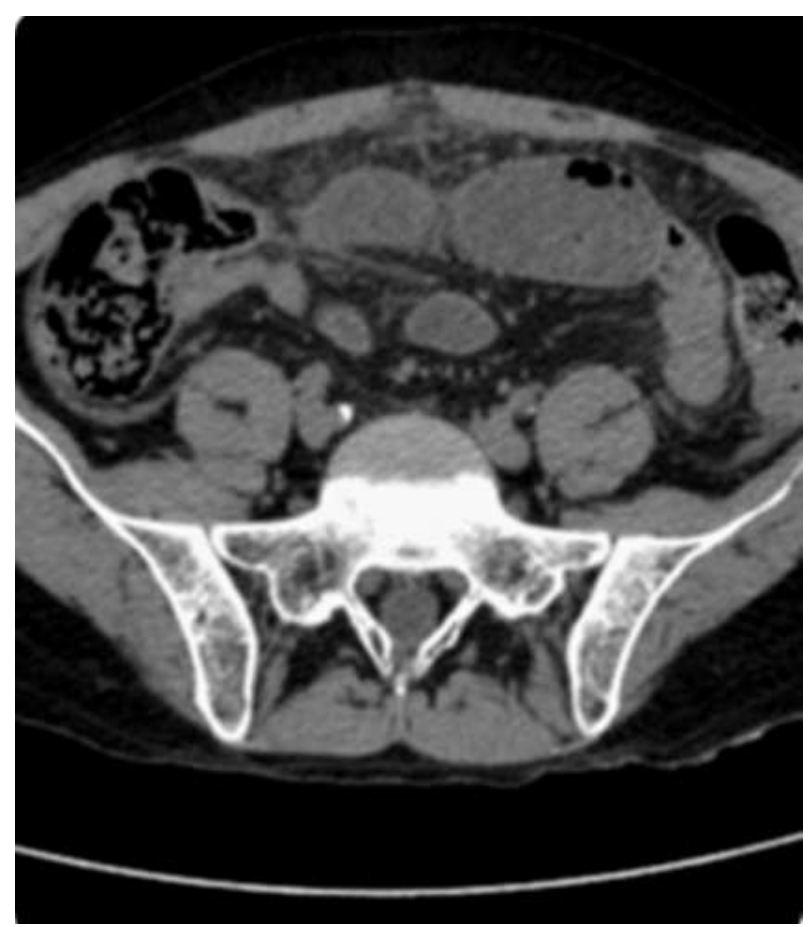
Figure 4: CT scan showing bowel thickening