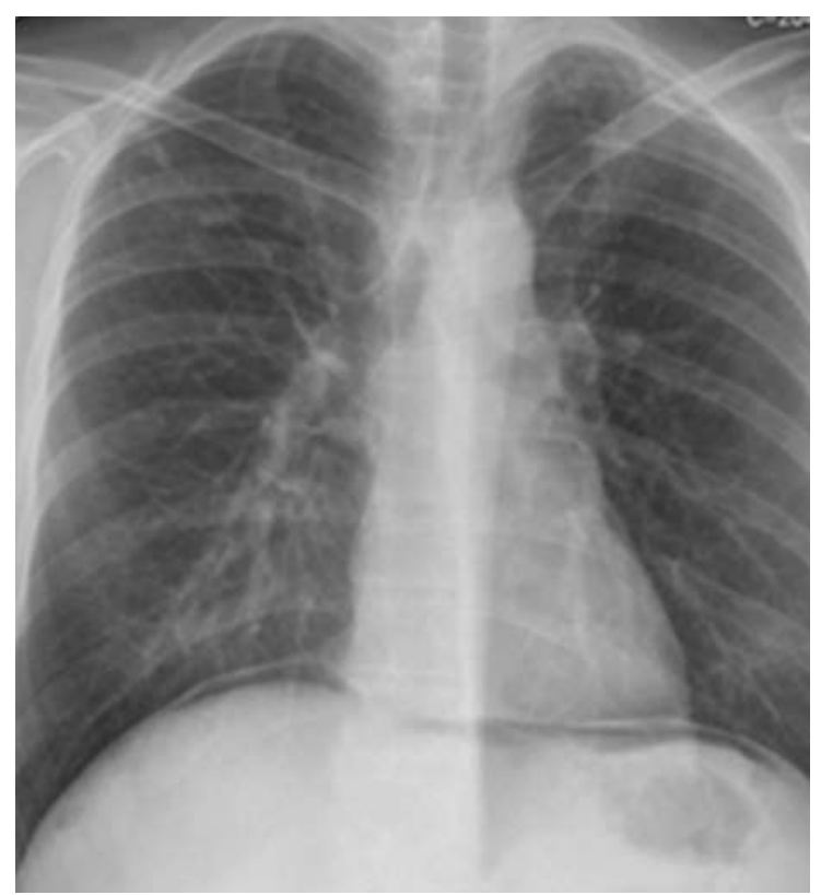
Figure 1: Thoracic radiography with pneumoperitoneum