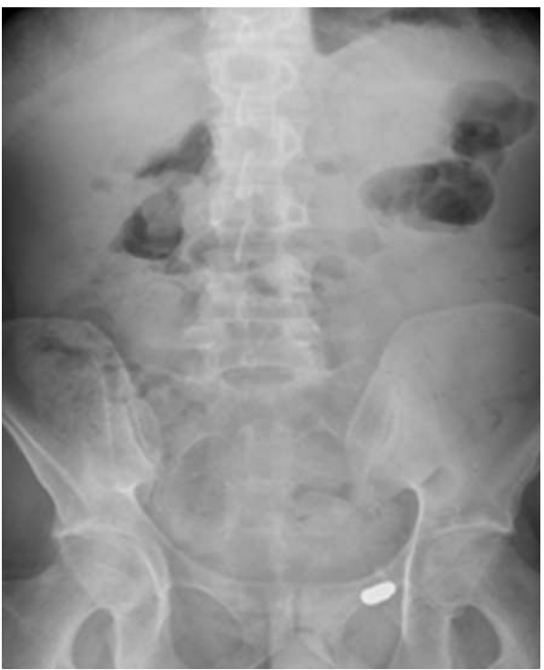
Figure 2: Abdominal radiography with pneumoperitoneum