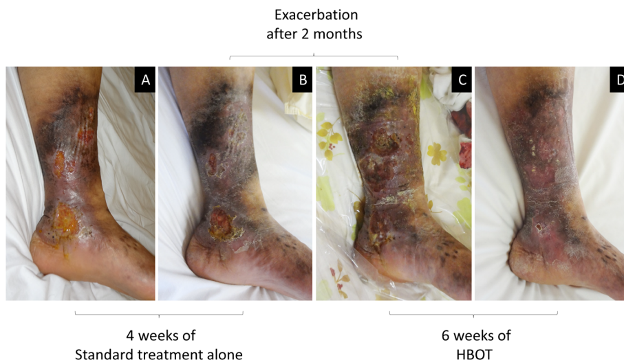
Fig. 1 Venous leg ulcer (VLU) in case 1 before and following first-time hyperbaric oxygen therapy (HBOT). A 37-year-old man, who worked in a soba restaurant standing for 11 h every day, had VLU for nearly 5 years (A). He was admitted for 4 weeks, and a standard treatment was administered, which improved the condition slightly (B). Two months later, he returned with seriously exacerbated VLU (C). After readmission, 28 sessions of HBOT (6 weeks) were administered, and the VLU eventually healed (D).

BMI: body mass index; VLU: venous leg ulcer; HBOT: hyperbaric oxygen therapy