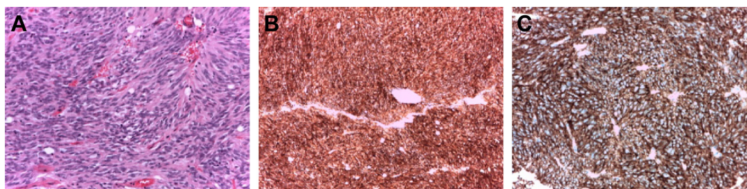
Figure 2 Gastrointestinal stromal tumor cell histology.

Macroscopically, the tumor was roundish and with a hard consistency; the maximum diameter was 8.5 cm. The cut surface was grayish and dishomogeneous for the presence of hemorrhagic areas. Histologically, the tumor was composed of bland spindle cells (Figures 1 and 2A). There were no areas of tumor necrosis. Many dilated and thrombosed vessels resembling similar findings seen in neurogenic tumors were intermingled within the tumor cells. Immunocytochemical stains revealed strong cytoplasmic expression of CD117 , DOG1 , and CD34 (Figure 2B and C). No expression was detected for desmin and S100 protein. c-KIT (exons 9, 11, 13, and 17) and PDGFRα (exons 12, 14, and 18) mutational analyses were performed by bidirectional Sanger sequencing, using BigDye Terminator chemistry, on a 3500 Dx Genetic Analyzer. The test results showed a single mutation in exon 17 of the c-KIT gene (pN822K; Figure 3), confirmed in two independent amplifications, while the PDGFRα mutational status