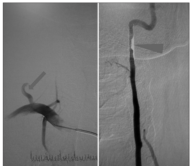
Figure 2: Digital subtraction angiography showing hypoplastic right vertebral artery (arrow) and left vertebral artery showing dissection flap (arrow head)

Mobile phones have become an essential part of human lifestyle. However, its usage has been associated with a host of health problems including eye strain, sleep disturbances, etc., Usage in the inappropriate time such as driving and position such as described above can be fatal. Public