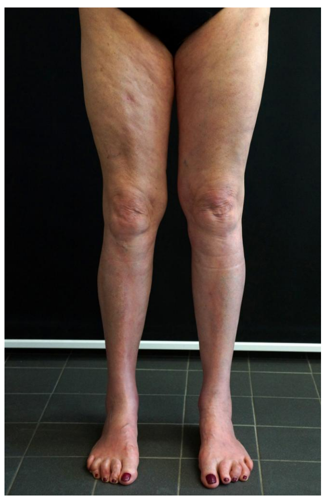
Figure 1: Eosinophilic fasciitis in a 65-year-old woman. Positive groove sign on her leg

On examination, we observed symmetric brownish hyperpigmentation on lower legs and lower arms, and the lower trunk. The skin appeared thickened, and it was impossible to crease the skin. The groove sign was positive on the legs (Figure 1). She had no Raynaud's phenomenon.