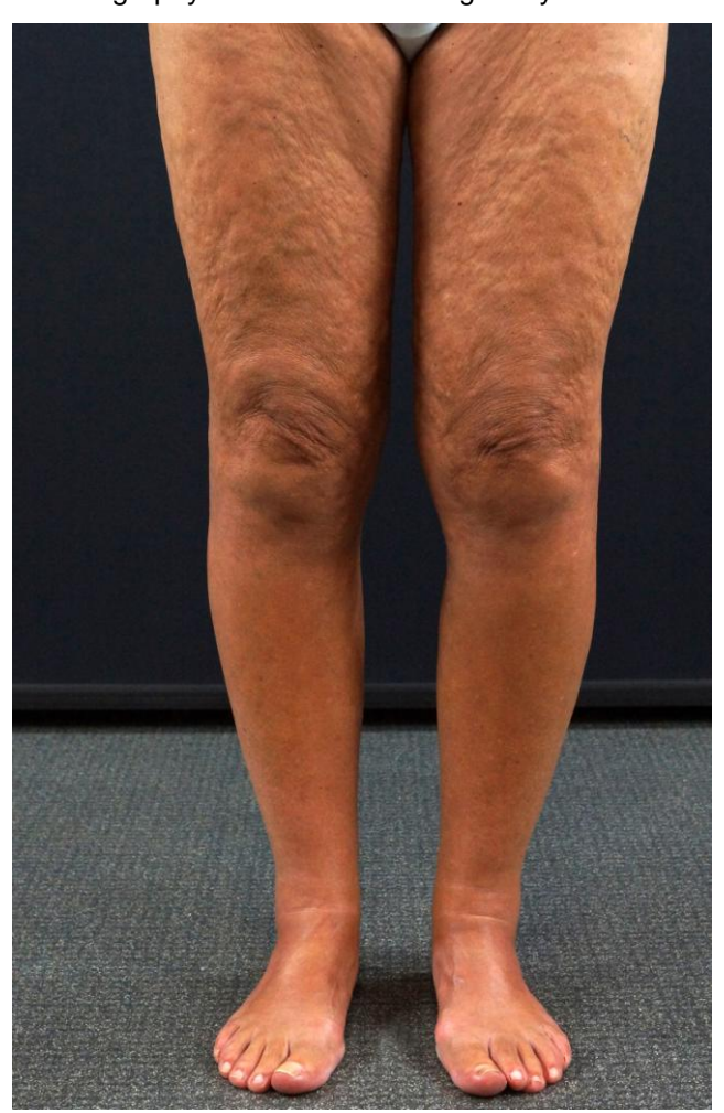
Figure 2: Eosinophilic fasciitis in a 64-year-old woman. Peau d'orange sign

abdomen: Steatosis hepatitis, liver hemangioma. MRI right lower arm: Hyperintense fascial signals. Mammography: Involution. No malignancy.