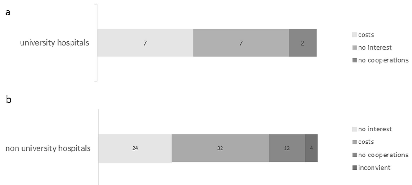
Fig. 2 Reasons for not establishing a robotic program. Main reasons for not adopting TORS at university hospitals (a) and non-university hospitals (b) is shown. The questionnaire allowed for multiple answers by one respondent

This work presents data characterizing the adoption of robotic surgery as well as the acceptance of this technique within Otorhinolaryngology Departments in Germany as first of its kind. With a response rate of 65.2% of all otolaryngology departments within Germany, participation in this study is satisfying. Data of this study were obtained from a voluntary-based survey with obvious limitation, such as respondent bias as well as lack of response from 57 parties. TORS for procedures in the oropharynx was the predominant