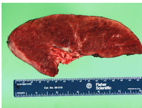
FIGURE 2: Gross photograph of explanted lung with a gritty, sand-like texture.