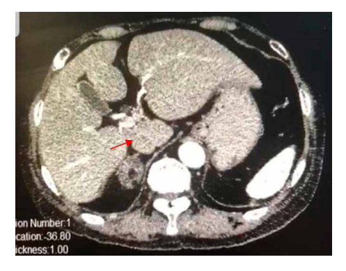
FIGURE 1: CT scan adrenal showing right adrenal adenoma.

GC, there was slight improvement in her Cushing's features, but they became more noticeable again in 2017. She then developed hypertension in 2010, diabetes mellitus in 2016, and had an osteoporotic fracture in 2011. During an admission for hypertensive crisis in 2017, a physician noticed her features and worked her up. During this admission, she had severe hypokalemia as well as hyponatremia. She was, however, on Indapamide for her hypertension prior to that.