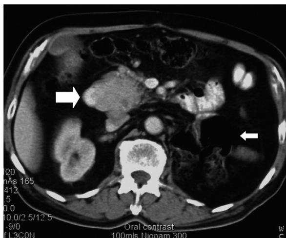
Figure 3 Abdominal CT scan. CT scan demonstrating the presence of a mass in the area of the pancreatic head and protruding into the duodenum (thick arrow) – note the previous left nephrectomy (thin arrow).

The patient was unable to tolerate interferon therapy. He became jaundiced due to tumour invasion of the distal common bile duct which was managed successfully by endoscopic biliary stenting. He received a total of 13-units of blood for symptomatic anaemia around the time metastatic disease was diagnosed, but since being commenced on a proton pump inhibitor his haemoglobin has remained stable.