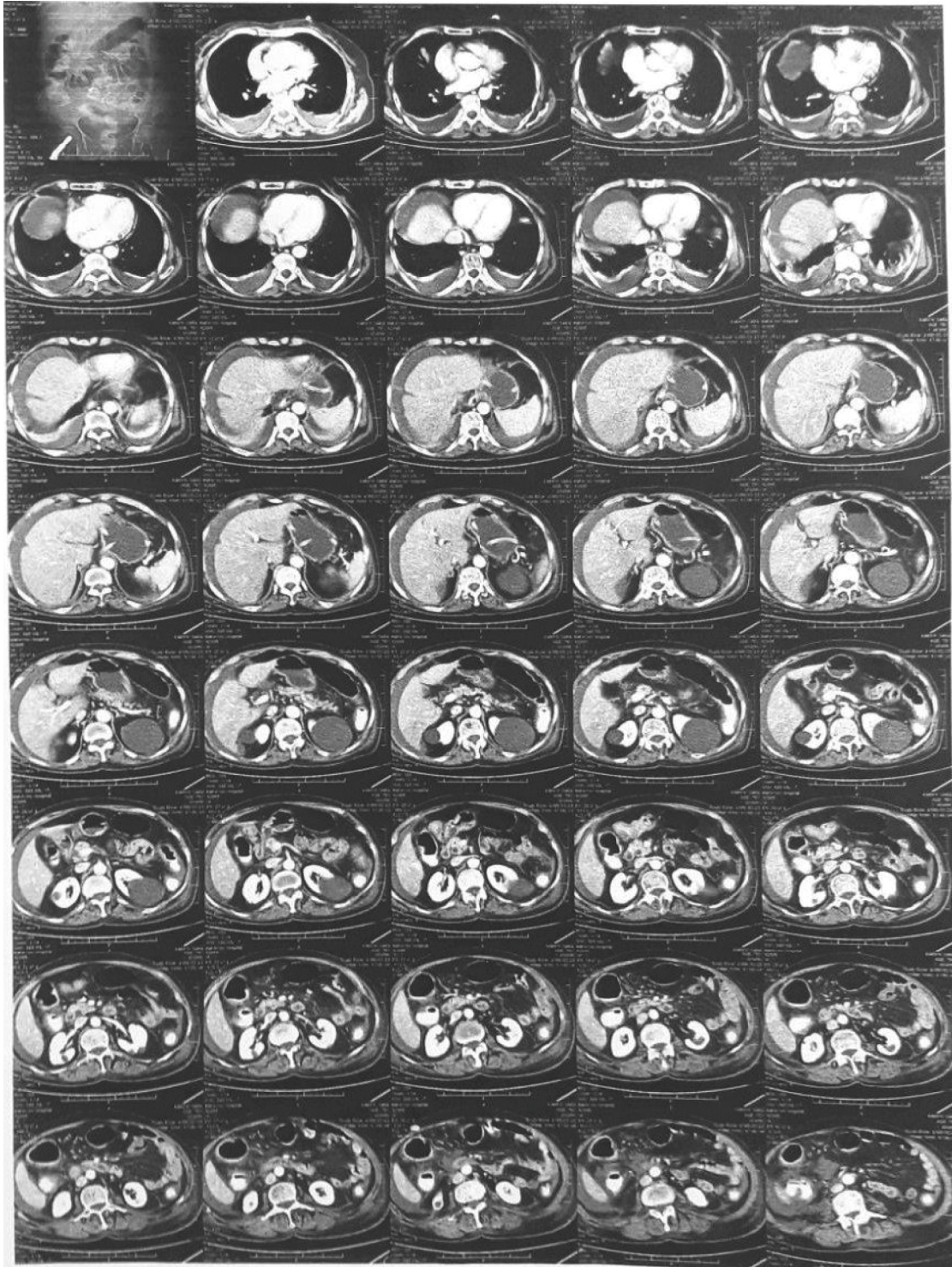
FIGURE 1: Computed tomography (CT) showing the presence of ascites and pleural effusion.

lower in patients treated with fidaxomicin [9]. Recently, fecal microbial transplant (FMT) has been introduced as the most recent therapeutic strategy for CDI, which is performed more than 3 times a day in the form of enema