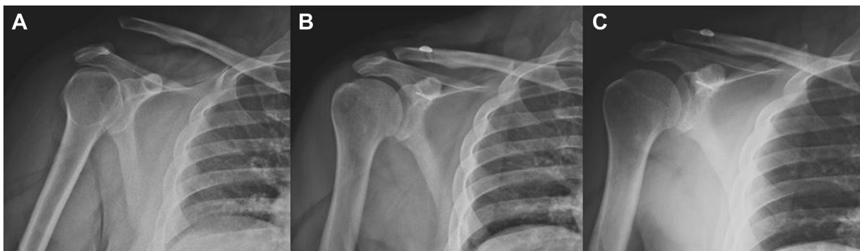
Figure 2 (A–C) Radiographic projections in right shoulder of patient classified as “without changes.”

The most frequent cause of AC dislocation was trauma by high-energy sports, occurring in 21 cases (40.3%), followed by falls while standing, in 20 (38.6%), and traffic accidents, in 11 (21.1%).