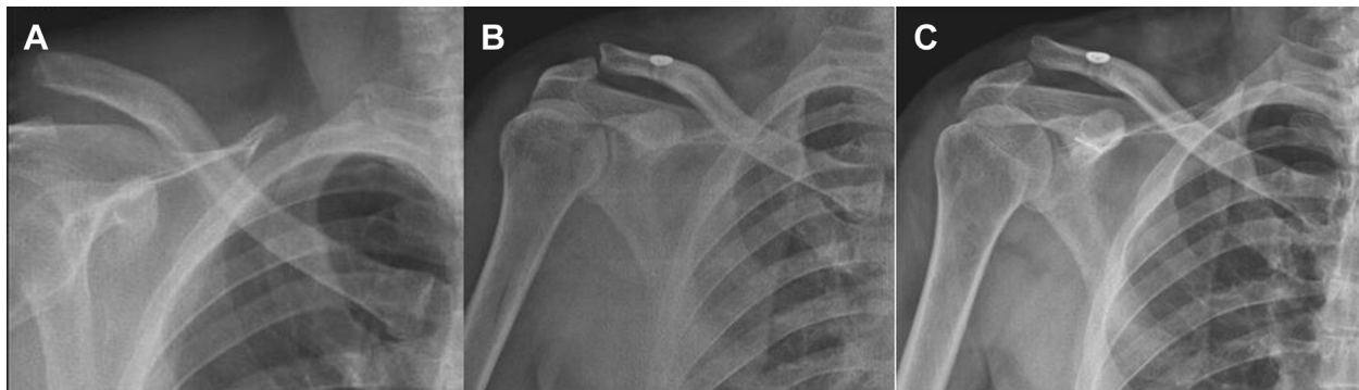
Figure 3 (A-C) Radiographic projections in right shoulder of patient classified as “lost reduction.”