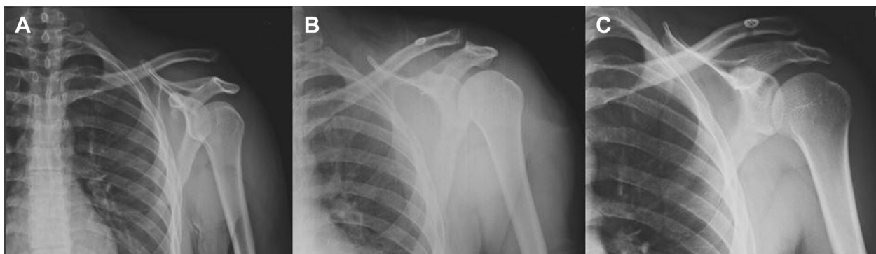
Figure 4 (A-C) Radiographic projections in left shoulder of patient classified as “failed reduction.”

On clinical evaluation, 31 cases (59.6%) showed excellent results whereas 21 (40.4%) showed good results on the UCLA scale, with a mean score of 33.2 points. The total UCLA score was 33.6 points in patients in whom the reduction was maintained; this result decreased to 32.1 points in patients with loss of reduction or with failure. However, no significant difference was found in function and symptoms between patients in whom the reduction was maintained and those with loss of reduction or with failure ( P = .095 ). Among patients in whom the reduction was maintained, the UCLA score was excellent in 24 (64.9%) and good in 13 (35.1%); in contrast, among patients with loss of reduction or with failure, the percentage of excellent results was lower (33.3%) and the percentage of good results was higher (66.7%). The relative risk of adequate outcomes on the UCLA scale for partial reduction or for failure was 1.7 (95% confidence interval, 0.8–3.7; P = .07 ) (Table II). The mean Constant score was 97.2 points in patients in whom the reduction was maintained compared with