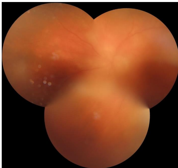
Fig. 1 Fundusoscopic image captured before treatment

We present an 83-year-old woman examined for acute vision loss in her left eye (LE). She was pseudophakic of both eyes (BE), her right intraocular lens (IOL) was subluxated and she also had a pseudoexfoliative glaucoma in her right eye (RE). In the initial exploration, her visual acuity (VA) was hand movements' recognition in both eyes. Slit-lamp examination showed an acute anterior uveitis with hyperemia and tyndall +++ in her left eye, and subluxated IOL in her right eye. The fundusoscopic examination revealed vitritis, temporal area of retinal necrosis with peripapillary choroiditis' spots and macular haemorrhages in her LE ( Fig. 1 ).