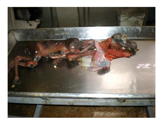
Fig. 1: The aborted camel fetus