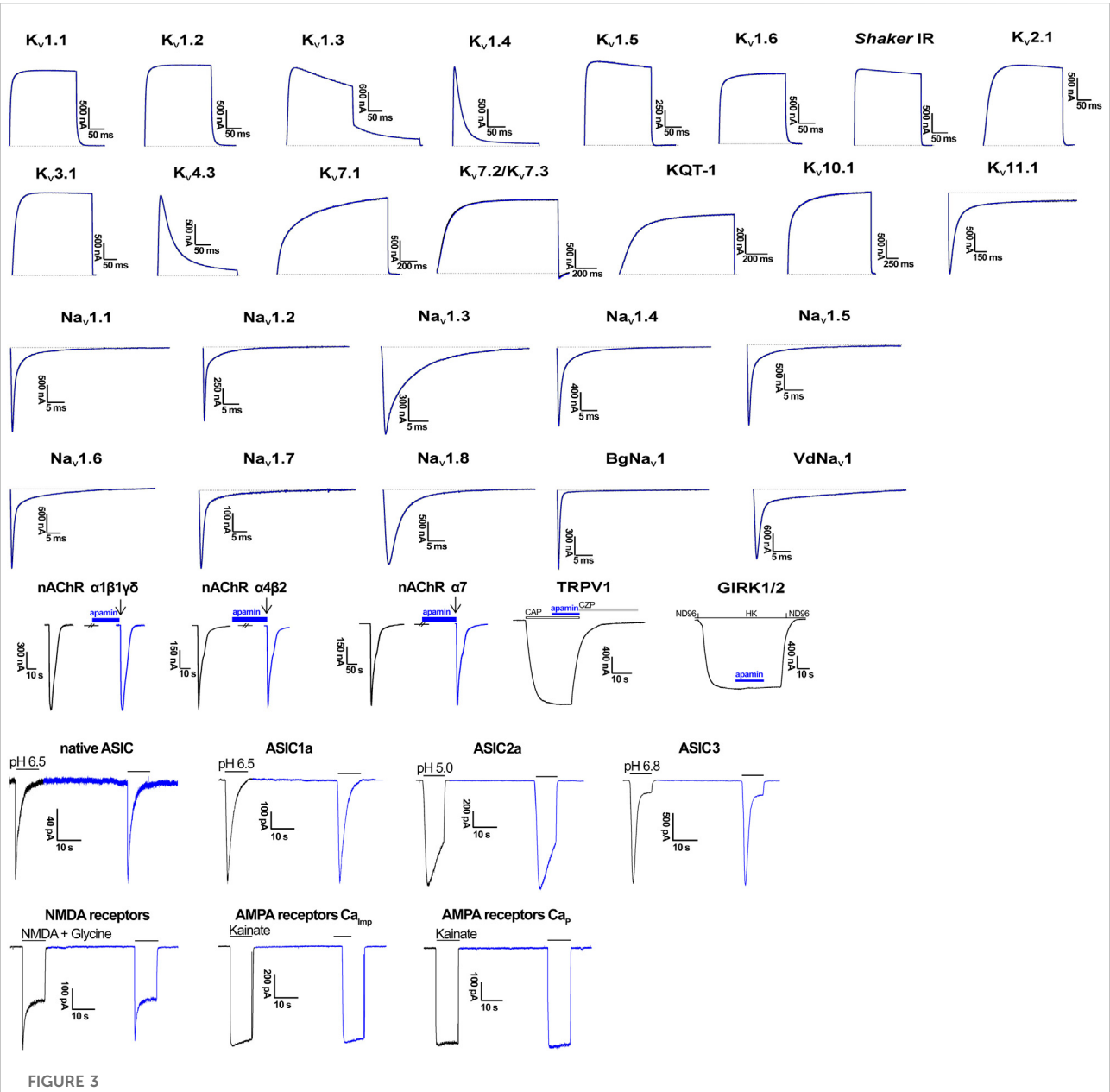
Electrophysiological profiling of apamin. Shown are representative traces of currents through the corresponding ion channels in control (gray) and after application of 5 µM toxin (blue). In the case of nAChR, TRPV1, and GIRK1/2, blue bars indicate apamin application. In nAChR, arrows indicate agonist (ACh) application. In TRPV1, the open bar shows agonist (capsaicin, CAP) application, and gray bar, antagonist (capsazepine, CZP) application. In GIRK1/2, presentation of different bath solutions is shown as line segments. In ASIC traces, application of the activating pH is shown with gray bars. And in GluR traces, gray bars depict the application of agonists. Ca<sub>Imp</sub>, Ca<sup>2+</sup>-impermeable; Ca<sub>P</sub>, Ca<sup>2+</sup>-permeable.