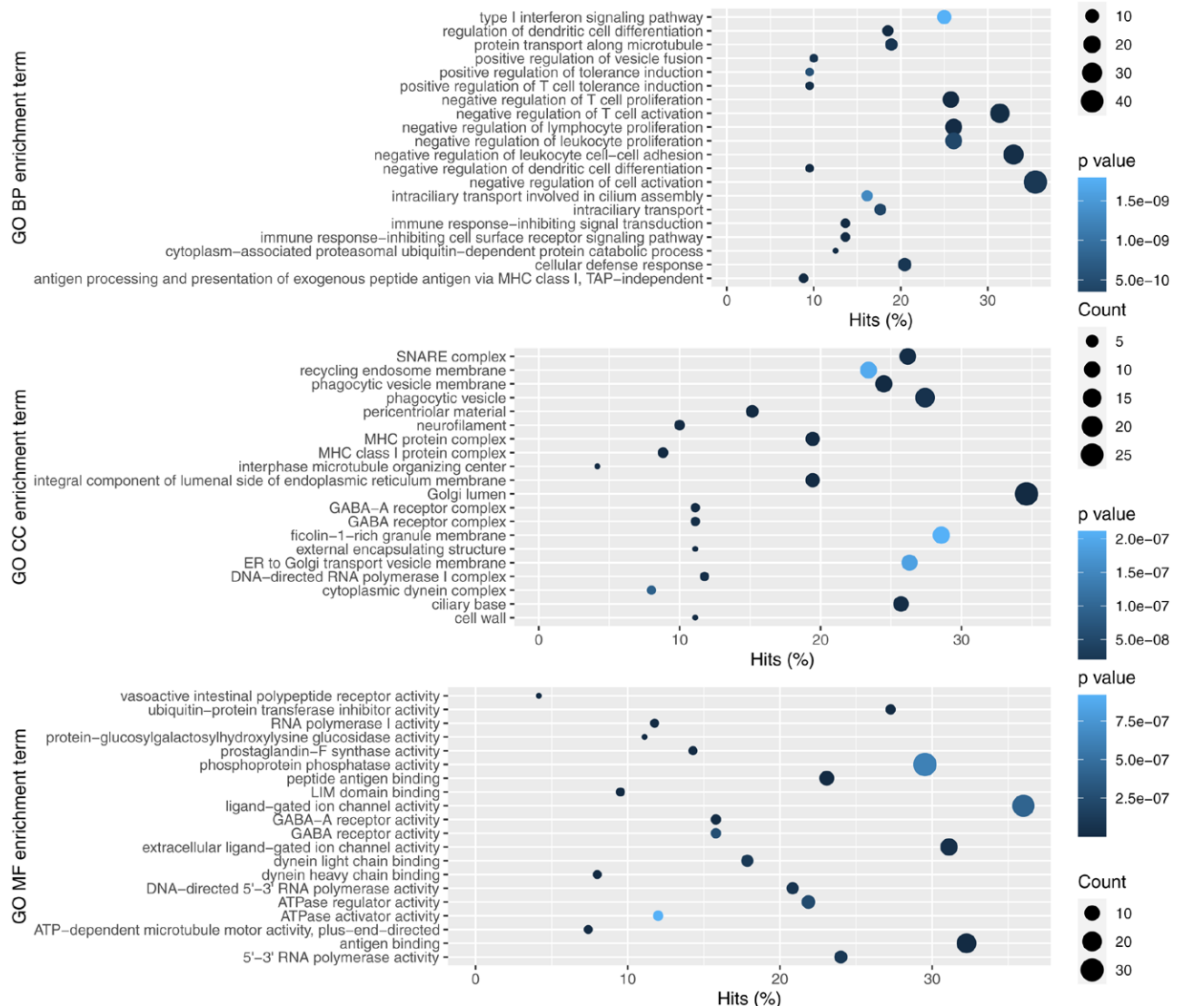
FIGURE 2. Enrichment in posttransplant samples. Top-ranked 20 gene ontology (GO) biological processes (BP), cellular component (CC), and molecular function (MF) enriched in R compared with NR in DMCs located within regions of DMRs in posttransplant samples. DMC, differentially methylated CpG; DMR, differentially methylated region; NR, nonrejector; R, rejector.

The genes associated with DMCs located within the DMRs regions in posttransplant samples were enriched for the biological processes of antigen processing and presentation of exogenous peptide antigen via major histocompatibility complex (MHC) class I, ( P = 4.4 \times 10^{-21} ) and cellular component of “MHC protein complex” ( P = 1.7 \times 10^{-23} ) and molecular function of peptide antigen binding ( P = 7.9 \times 10^{-17} ) (Figure 2, Table S6, SDC, http://links.lww.com/TXD/A466 ). DMCs in pretransplant samples were enriched for the top-ranked biological processes of “regulation of thyroid-stimulating hormone secretion” ( P < 3.1 \times 10^{-58} ) and several developmental and morphogenesis processes. “Antigen processing and presentation of exogenous peptide antigen via MHC class” ranked 17th among