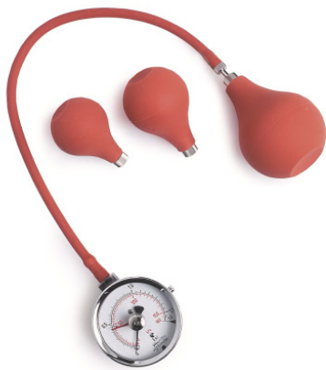
Fig. 2. Pneumatic type dynamometer (Martin Vigorimeter). Three sizes of balloons are available for pediatric and adults.

As this type measures the pressure by pressing a rubber bulb, patients can press it with less force than other types of dynamometer, which minimizes pain. [21,22] Therefore, it is useful for measuring HGS in old patients with arthritis or sarcopenia or in children with weak HGS. [21,30,31] However, this type can be influenced by hand size. [19] It measures grip pressure, which is dependent on the surface area over which the grip force is transmitted. If the same grip force is applied to the air bulb, the subjects with a bigger hand can generate bigger pressure than smaller ones. Three sizes of balloons are available for pediatric and adults (Fig. 2).