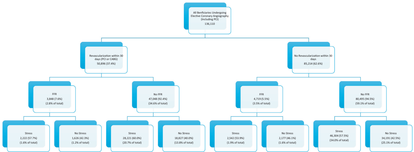
Fig. 1. 2012–2014 rates of stress testing, FFR, and revascularization in beneficiaries undergoing elective coronary angiography.

receiving FFR. Prior stress testing within 30 days of the diagnostic coronary angiography was also a negative predictor for FFR use. FFR use, varied across US regions from 4.1% to 8.6% with a mean of 6.8% ± 1.7%. The South Atlantic and East South Central regions showed lower FFR use while the New England and West North Central regions had greater FFR use (Fig. 2).