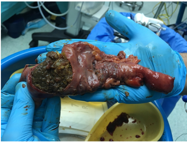
Fig. 3. Resected bowel segment with Meckel's.