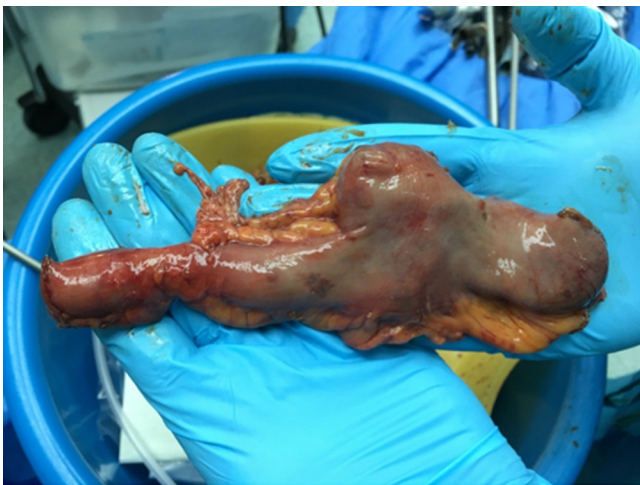
Fig. 4. Meckel's opened showing the Phytobezoar.

The term Bezoar came from the Arabic “badzehr” or from the Persian “panzer,” both means counter poison or antidote [6]. Excessive intake of fruits and vegetable fibers, as a feeding habit, can predispose to phytobezoar formation. This is presumably due to collection of fibrous and indigestible food, rich of slags of alimentary material, in an altered or slow flow area or into a stenotic narrowed area. The presence of intestinal dysmotility and poor coordination of the peristaltic waves at the site of the Meckel's diverticulum could produce decreased ileal motility and slow intraluminal flow with impaction and stickiness of boluses of food [7,8].