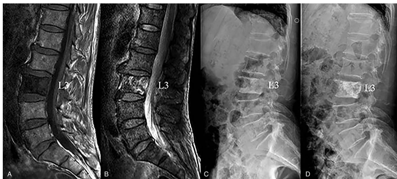
Figure 2. A representative case of a male patient with L3 OMVT who received KP treatment. (A and B) Preoperative MRI examination. There were MRI signal changes in the T1wi and T2wi. Low signals on the T1 sequence and high signals on the T2. (C and D) A comparison of preoperative and postoperative X-ray. No bone destruction and vertebral collapse were observed in preoperative X-ray.

In the MVT group, The VAS score decreased from 7.73 \pm 0.94 preoperatively to 3.22 \pm 0.80 postoperatively ( P < .01 ), and remained at 2.61 \pm 0.84 1 year after operation. The ODI score decreased from 69.20 \pm 7.14 preoperatively to 28.02 \pm 4.40 postoperatively ( P < .01 ), and remained at 28.37 \pm 5.53 1 year after operation. The vertebral height of MVT patients improved significantly compared with that preoperatively ( P < .01 ) (Table 2).