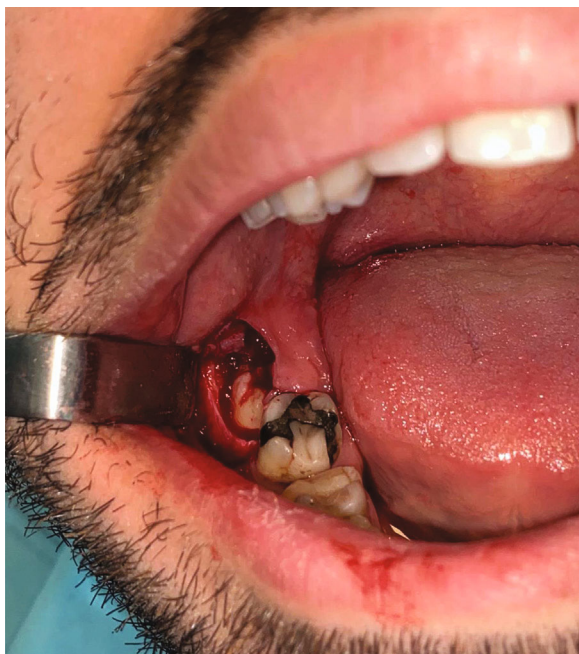
FIGURE 1: The same osteotomy technique was performed to remove the buccal bone around the crown of the impacted tooth in all groups. No tooth sectioning was performed.