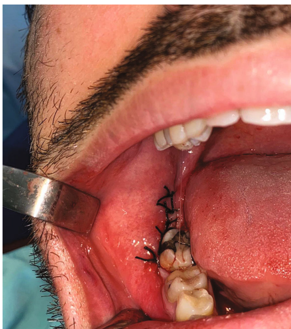
FIGURE 2: In all cases, PRF was placed gently without aspiration and the wound was immediately closed with 3-0 silk sutures.

Dohan et al. Approximately 15 min before the surgery, a blood sample was taken in a 10 mL glass-coated plastic tube without anticoagulant. The sample was immediately centrifuged (Elektro-mag M415P) at 3,000 rpm for 10 min (approximately 400 g) [14]. The platelet-poor plasma that accumulated at the top of the tube was discarded. The PRF was dissected around 2 mm below its contact point with