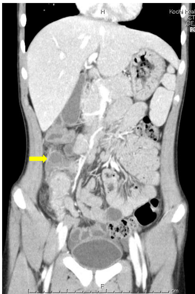
Fig. 1. Preoperative findings. Coronal view of contrast-enhanced computed tomography revealed wall thickening of the well enhanced terminal ileum and fluid collection with a contrast-enhanced wall at the ventral side of the ascending colon.