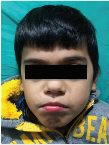
Figure 1: (Front Profile showing broad square face)