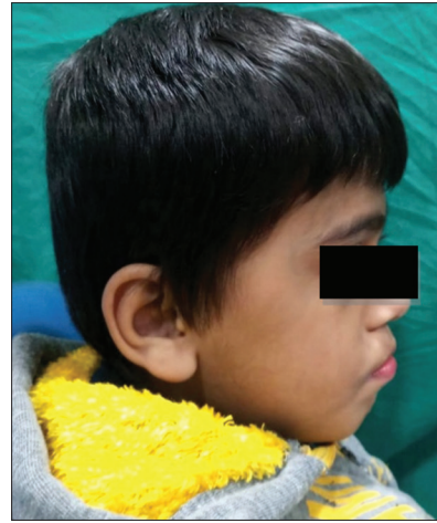
Figure 2: (Side Profile showing midface hypoplasia, mandibular prognathism)