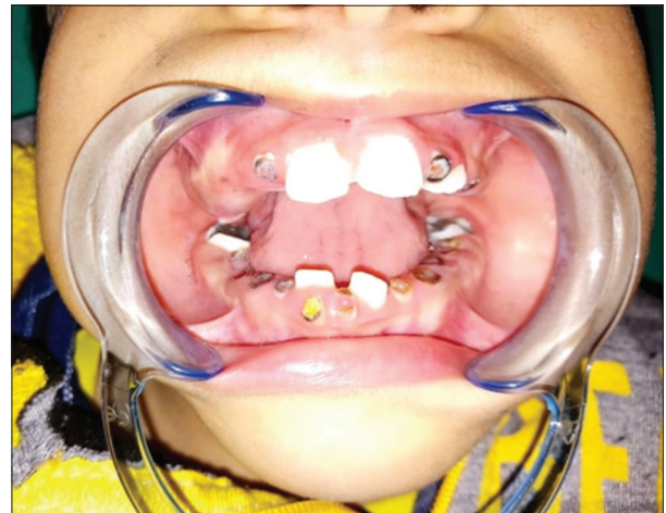
Figure 4: (Intraoral photograph showing multiple carious teeth)