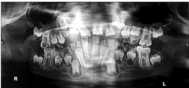
Figure 5: (Orthopantomogram showing Taurodontism in 16 and 26)