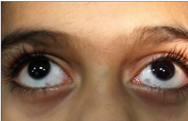
Figure 3: (Strabismus)