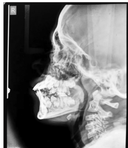
Figure 6: (Lateral cephalogram showing bimaxillary protrusion)

The ophthalmic examination reported the patient to be having myopia and strabismus.