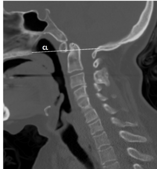
Figure 2- Demonstrating the Chamberlain line used to evaluate basilar invagination. CL - Chamberlain line

Patients were divided into two groups based on the presence (CVJ+) or absence (CVJ-) of an abnormal finding in one of the included parameters related to the CVJ. To be included in the CVJ+ group, a patient had to have at least one of the following features: short