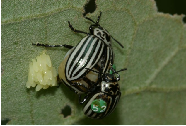
FIGURE 1 Male and female of the leaf beetle Leptinotarsa undecimlineata on the host plant after copulation. Note that the male (below) is smaller than the egg-laying female and that the abdomen of the female is very inflated due to the egg load in the reproductive tract, so that the two elytra do not touch each other.

plants and are rarely found elsewhere. Over the course of the breeding season, both males and females mate repeatedly and promiscuously. Following copulation, males usually perform mate guarding by staying near the female or mounted on her (Figure 1). Males may attempt to displace other males during copulation, but they do not perform prolonged territorial or female defense nor present any visible weapon or sexually dimorphic secondary trait (Baena & Macías-Ordóñez, 2012, 2015).