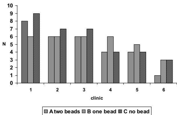
Figure 2 Attendance of 3 groups each week – all attendees were confirmed abstinent on each meeting: all dropouts were assumed to have relapsed.

one used small numbers of microtabs, taking only 16 mg nicotine in the last week: another used large numbers of nicotine gum 4 mg, amounting to 308 mg in the last week. The alternative measure for NRT use, counting used packs, was also unsuccessful. We conclude that further investigation of the best way to measure NRT consumption is needed before this can be considered a suitable outcome for a clinical trial.