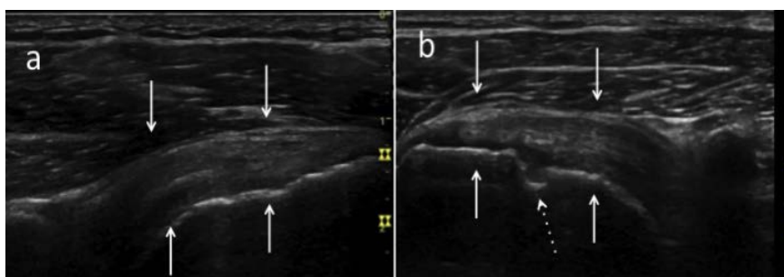
Figure 2. Same patient. Sagittal views of (a) normal left subscapularis tendon (b) repaired, intact right subscapularis tendon arrows: subscapularis tendon, dashed arrow: hole drilled by the surgeons.