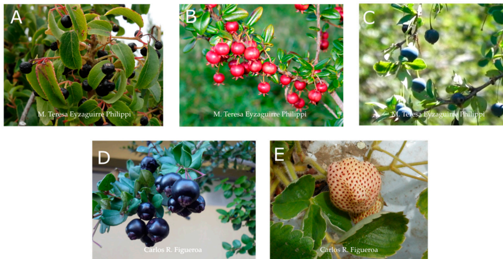
Figure 1. Patagonian berries with healthy potential as a functional food on the basis of recent research data available. (A) Aristotelia chilensis (Mol.) Stuntz (maqui)*; (B) Ugni molinae Turcz. (murta)*; (C) Berberis microphylla G. Forst. (calafate)*; (D) Luma apiculata (DC.) Burret (arrayán)**; (E) Fragaria chiloensis (L.) Mill. (Chilean strawberry)**.

The shape of murta and arrayán fruit was reported as globular, with a major equatorial diameter [21,44]. As far as we know, the only report for arrayán fruit development was made by Fuentes et al. (2016) [21]. In that work, the authors classified the fruit development into four stages, mainly by fruit shape and skin color: small and thin green (La1), rounded turning (La2), rounded purple (La3), and black ripe (La4) berries, with a decrease in lightness ( L^* ), b^* , and chroma values of fruit skin from approximately 48 to 23 from La1 to La4. As expected, a constant increase in the fresh and dry weight was observed during fruit development, although a higher increment was noted between the La3 and La4 stage [21].