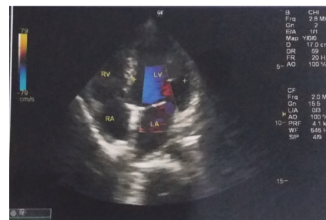
FIGURE 2: Echocardiography of the patient.