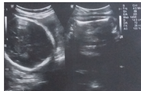
FIGURE 3: Obstetric ultrasound of the patient.

and severely deranged diastolic flow in umbilical artery (Figure 3). The couple were counselled adequately about fetomaternal prognosis and after their informed consent, she was given two doses of betamethasone for lung maturity, following which induction of labor was done with cervigrel at 35 weeks two days. Her labor progressed well and she delivered live boy baby weighing 1.2 kgs, who was transferred to nursery, being very low birth weight baby, and discharged after one month. Patient's intrapartum and postpartum period were uneventful and she was discharged on higher dose of prednisolone, amlodac 7.5 mg, and levetiracetam. At the time of this writing, she is convalescing well, with both mother and baby doing fine, and following up periodically with cardiologists, rheumatologists, and gynecologists.