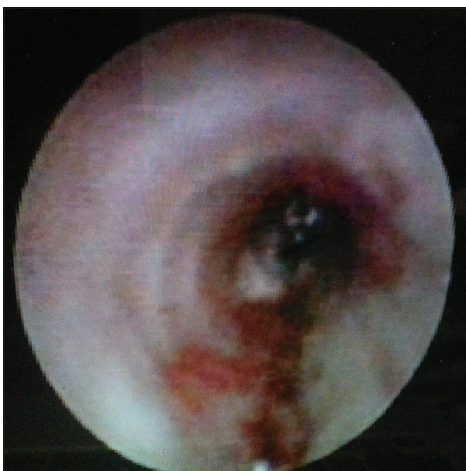
Figure 1: Flexible bronchoscopic appearance of right main bronchus showing linear tear of posteromedial aspect

Pplt: Plateau pressure; MAP: Mean airway pressure; P/F: PaO 2 /FiO 2 ratio, PaO 2 : Partial pressure of oxygen in arterial blood; FiO 2 : Fraction of oxygen in inspired air, OI: Oxygenation index; PaCO 2 : Partial pressure of CO 2 in arterial blood