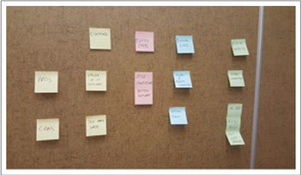
Figure 1. P2's recreation of her work space during Activity 2 with sticky notes representing artifacts at her work-desk

P2 mentioned clutter, changing work-desks, and a smartphone to be her challenge points. Strategies used to mitigate these challenge points were color-coded cheat-sheets and asking for help from other people at work.