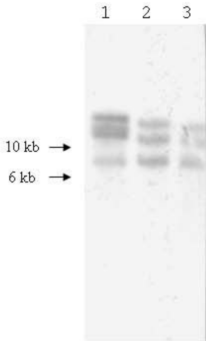
Figure 4 Southern blot hybridization analysis of genomic DNA digested with Pst I from T. asinigenitalis UCD-1 T (lane 1), UK-1 (lane 2) and UK-2 (lane 3) isolates, by using the ISRA from the UCD-1 T (UCD-1 TA ) as a probe.