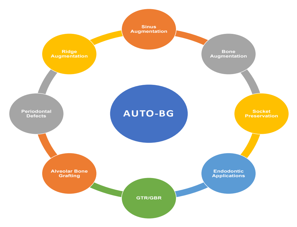
Figure 2. Clinical applications of AUTO-BG.

Following the development of the AUTO-BG technique and development methods, it has been explored for a range of clinical conditions in the craniofacial region (Figure 2).