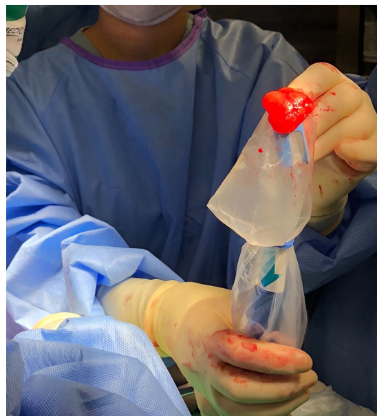
Figure 1. Measurement of ex vivo radionuclide counts.

Patients were stratified based on whether their hyperparathyroidism was due to a single adenoma, double adenoma, or hyperplasia. Sixty-eight patients had a single adenoma, 24 had