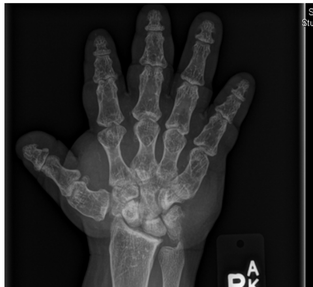
Figure 1A Radiograph of the right hand. Note the shortening of each of the metacarpals, including coarsening of the trabeculae in all of the digits.

Given the clinical, radiographic, and laboratory findings, presumptive diagnoses of PHP type Ia and mild primary hypothyroidism were made. An Ellsworth–Howard test was performed, which established the presence of resistance to PTH. The patient was admitted to the medical wards, where her hypocalcemia was corrected using both intravenous and oral calcium, vitamin D, and calcitriol. With correction of the hypocalcemia, there was complete resolution of the prolonged QT interval initially seen on electrocardiogram in the emergency room.