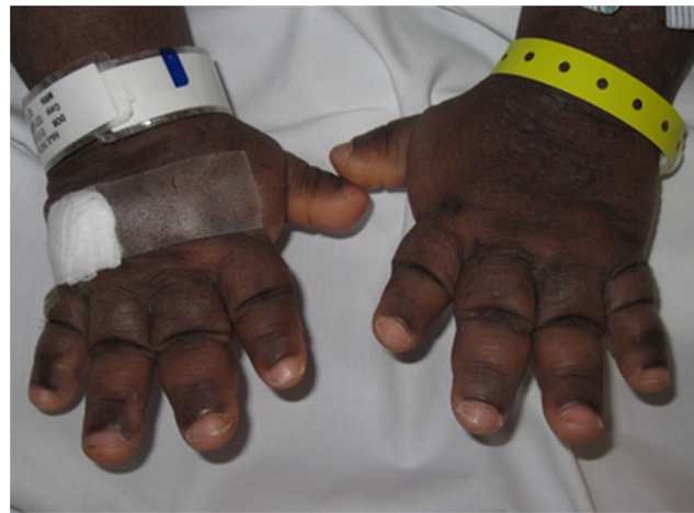
Figure 1 Note the brachymetacarpals bilaterally along with widened fingernails, suggestive of Albright's hereditary osteodystrophy.

On examination, the patient was alert, but had difficulty answering questions appropriately. She had short stature, a rounded face, and central adiposity, with height and weight measuring 139.7 cm and 64 kg, respectively. Markedly positive Chvostek and Trousseau signs were elicited. Examination of the extremities revealed brachydactyly of the fingers (Figures 1 and 1A) and second, third, fourth, and fifth toes (Figures 2 and 2A). Admission laboratory results are presented in Table 1. An electrocardiogram performed in the emergency room was remarkable for a prolonged QT interval. The patient had no known personal or family history of congenital or