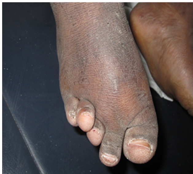
Figure 2 Note the brachymetatarsia of the patient's right foot, characteristically seen in Albright's hereditary osteodystrophy.

The patient was discharged on 112 mcg of levothyroxine daily, 1 g of calcium carbonate twice daily, 50,000 IU of ergocalciferol weekly, and 0.5 mcg of calcitriol twice daily. Phenytoin was discontinued and the patient was placed on levetiracetam for seizure prophylaxis as it does not interfere with hepatic conversion of vitamin D to 25-hydroxyvitamin D. Phenobarbital was gradually tapered down to a lower dosage and eventually discontinued. The patient was followed up at monthly intervals for a duration of 3 months and has remained seizure free since discharge.