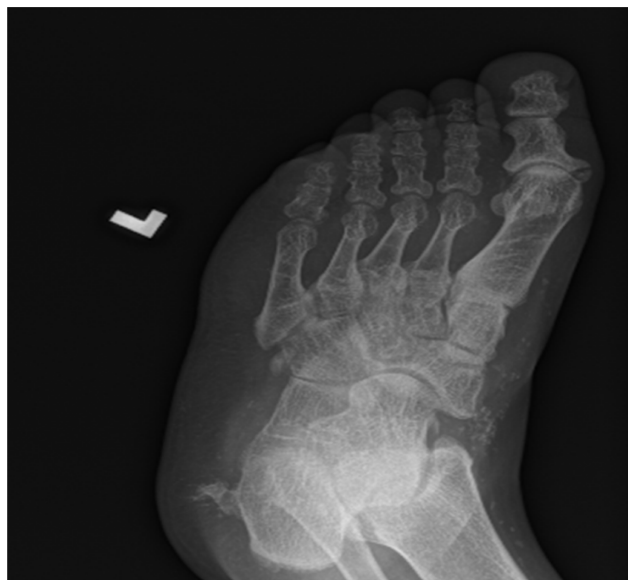
Figure 2A Radiograph of the left foot. The foot appears small with congenitally short metatarsals, especially metatarsals 2, 3, 4, and 5. The proximal phalanges also appear shortened.

The patient was discharged on 112 mcg of levothyroxine daily, 1 g of calcium carbonate twice daily, 50,000 IU of ergocalciferol weekly, and 0.5 mcg of calcitriol twice daily. Phenytoin was discontinued and the patient was placed on levetiracetam for seizure prophylaxis as it does not interfere with hepatic conversion of vitamin D to 25-hydroxyvitamin D. Phenobarbital was gradually tapered down to a lower dosage and eventually discontinued. The patient was followed up at monthly intervals for a duration of 3 months and has remained seizure free since discharge.