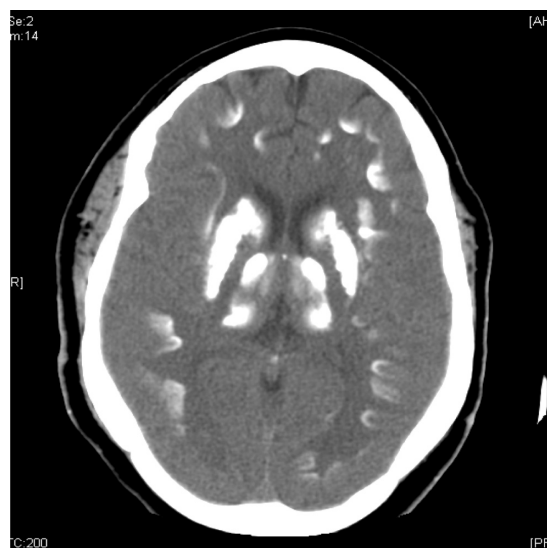
Figure 3 Non-contrast computed tomography of the brain. Intracranially, there are extensive calcifications within the cerebellar hemispheres bilaterally in the basal ganglia and in the parenchyma of the brain.

Given the patient's diagnosis of PHP type Ia, the patient's brother and mother, who exhibited the phenotypic appearance of AHO, underwent laboratory evaluation for PHP type Ia and pseudo-PHP. Laboratory results for the patient's brother revealed serum concentrations of calcium,