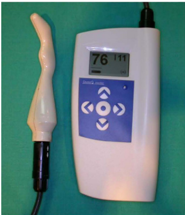
Fig. 3. An Osstell transducer

3.-Resonance Frequency Analysis: An Osstell frequency resonator was used (Integration Diagnostics, Goteborg, Sweden) (Fig. 3) with a 5-mm-high transducer abutment compatible with an external universal hexagon platform. Measurements were made after the initial implant placement and 5 weeks later. The implants were evaluated using the Implant Stability Quotient (ISQ), which is a