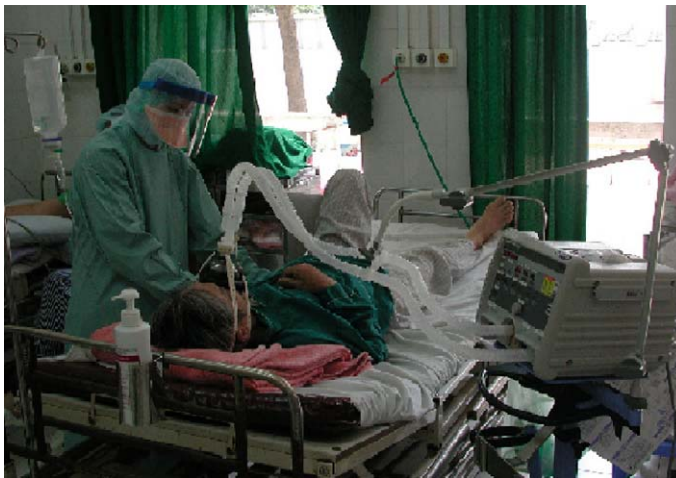
Fig. 3. A medical staff with complete protective attire, who is treating a serious SARS patient.