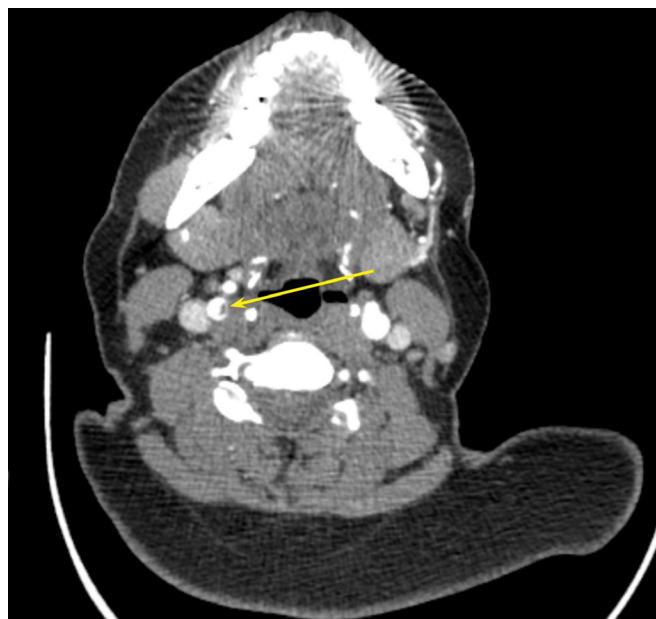
Figure 3 CT angiogram demonstrating partially occlusive thrombus in the right internal carotid artery (yellow arrow).

CVST is a rare condition that affects 0.22–1.57 per 100 000 population annually and accounts for approximately 0.5%–1% of all strokes per year. 9 The median age of patients presenting with CVST is 37 years old and approximately 8% of patients are 65 years of age or older at the time of diagnosis. Multiple identifiable risk factors have been identified, including prothrombotic conditions (inherited or acquired), use of hormone therapy (including oral contraceptive pills), pregnancy and the postpartum period, malignancy, infection and mechanical precipitants (lumbar punctures). As of 12 April 2021, there have been