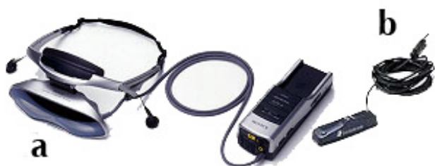
Figure 2 The virtual reality equipment. a) the Head Mounted Display, Sony Glasstron PLM S-700; b) the position tracker, Intersense Intertrax2 256 Hz.

The protocol will follow the following schema: