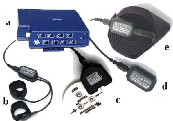
Figure 1 The Procomp Infiniti System. a) the Procomp Infiniti control box; b) the Skin Conductance Response sensors; c) the Electromyography sensor; d) the Blood Volume Pulse sensor; e) the Respiration sensor.

will be distributed to each participant practice 2 weeks before the appointment is due.