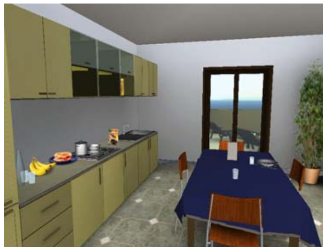
Figure 4 A screenshot from NeuroVR (V. 1.5). The figure illustrates a virtual kitchen, one of the stressful environments showed to the patients during the last week of treatment.

ical (increased heart rate, blood pressure, sweating etc.), behavioral (trying to escape from the anxious situation, trembling etc.), and subjective (negative thoughts like 'I am going to faint or lose control' etc.). The strength of these components varies between patients, but previous research has found that most people experience some physiological changes, followed by a negative thought, which increases the physiological reaction, generating a vicious circle.