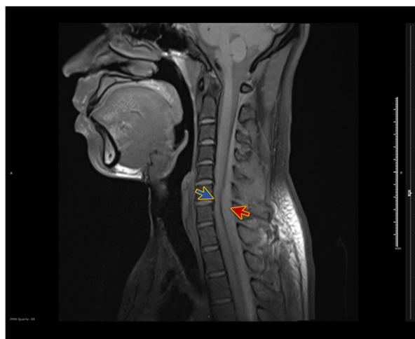
Figure 1. Magnetic resonance imaging with contrast, sagittal view whole spine. The figure shows acute spinal subdural canal hematoma (red arrow), producing cord compression (blue arrow) at the C6–C7 level.

A left-side posterolateral intraspinal extramedullary lesion was observed outside the thecal sac. It was appeared to be