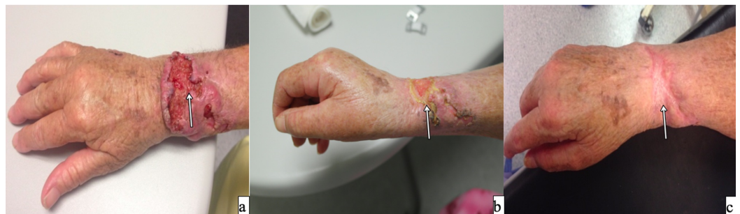
FIGURE 3: A 71-year-old female with SCC on her right wrist

A 71-year-old female developed a right wrist low-grade squamous cell cancer with infiltration to the deep fascia of the right-hand dorsum. Isolated perfusion was done (infusion rate 200-350 mL/h, leak less than 1%, TNF \alpha 20 min, melphalan 45 min) with no adverse effects (Wieberdink II). The patient was 24 hours in the ICU. A posterior biopsy was taken, with dense fibrotic and necrotic tissue, no residual tumor was reported. The patient had a regional recurrence on the axillary lymph nodes six months later. A lymphadenectomy followed by radiotherapy was decided, with metastatic disease on 2/23 of the lymph nodes. Six years after the procedure, the patient continues disease-free status (Figure 3).