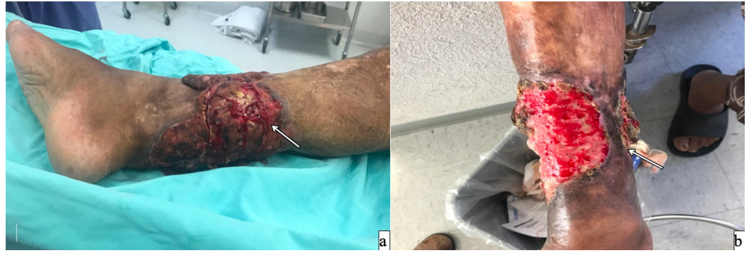
FIGURE 2: A 58-year-old male's right leg with a squamous cell cancer with recurrent infection

a) previous to TP-ILP; b) ongoing response after two weeks. The patient required amputation due to the persistence of the infection.