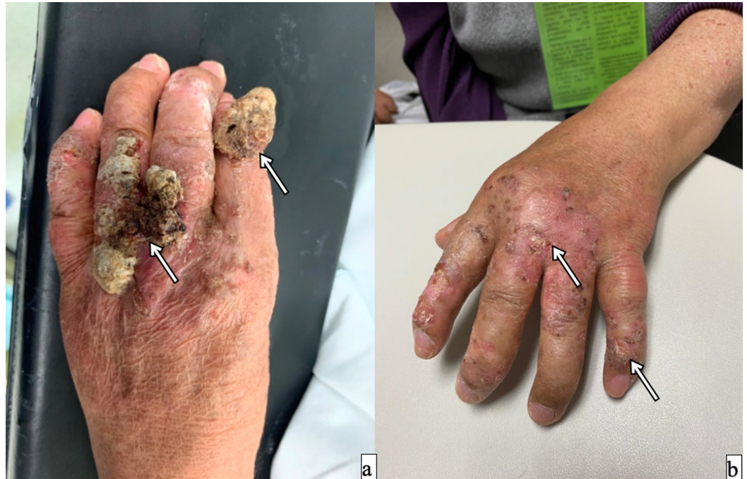
FIGURE 4: A 76-year-old female with a SCC on her left hand

A 76-year-old female with a history of type 2 diabetes mellitus, noncontrolled systemic hypertension, developed a tumor in the dorsum of second, fourth, and fifth fingers on the left hand. Perfusion was done (leak rate lesser than 2.4%, TNF \alpha 10 min, melphalan 20 min). The patient stayed in the ICU for 24 hours with no adverse effects (Wieberdink I) and was discharged three days later. The patient had a clinical response about 60% of the tumor size, with an adequate function of the hand (Figure 4). Four months later, the patient had a new onset of tumoral activity on the preauricular and nasal dorsum region.