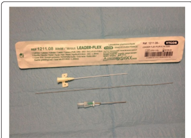
Fig. 1 Eight-centimeter polyurethane catheter + 20G needle + 20-cm straight tip guide wire

The patient forearm is supinated and examined with ultrasound so to identify the most appropriate vein to cannulate in terms of position, diameter, and depth (Fig. 2a). Only veins with diameter >3 mm and depth <30 mm from the skin are considered. Upper mid-arm veins (specifically, basilic and brachial veins) are preferred to veins below the elbow. The tourniquet is placed above the elbow, very close to the axilla. The puncture site is scrubbed with 2 % chlorhexidine antiseptic swabs and protected by a sterile fenestrated drape.