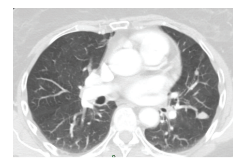
FIGURE 2: CT scan with lung metastases.