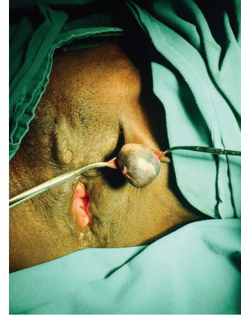
FIGURE 1: Preoperative inspection of left vulvar region.