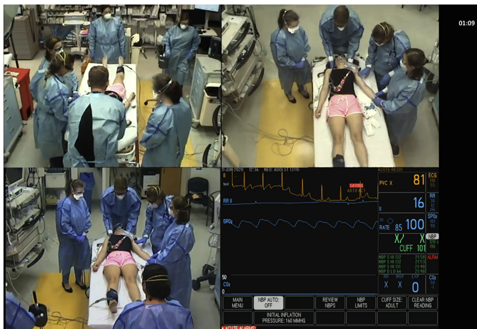
Figure 1. Video review platform using the B-Line LiveCapture system, displaying 3 camera views available in addition to the patient monitor. One camera view is replaced by the video laryngoscope feed during intubation. (Patient actor in simulated resuscitation.)